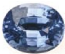
fine oval sapphire